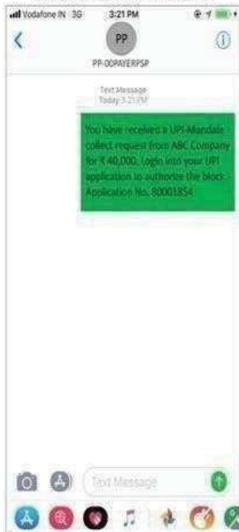
Block request SMS to Investor